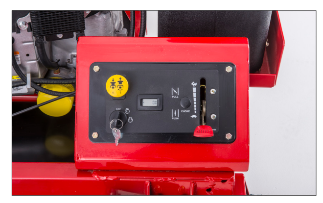
TRACER | Control Panel