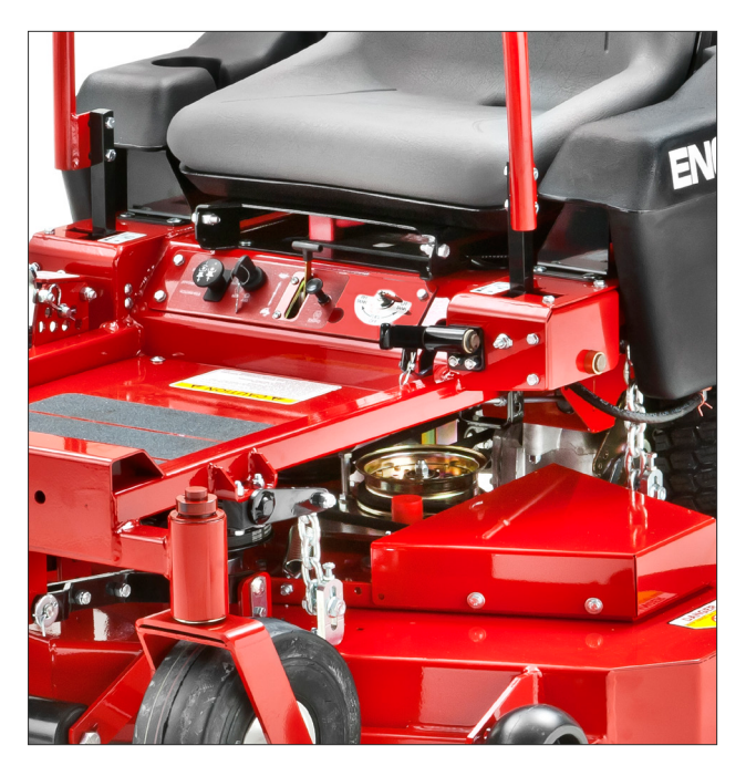
FUZION | Front Left View