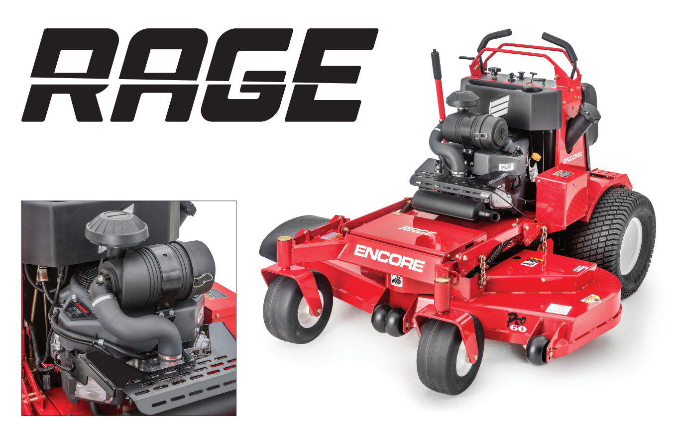
RAGE | Kawasaki Engine