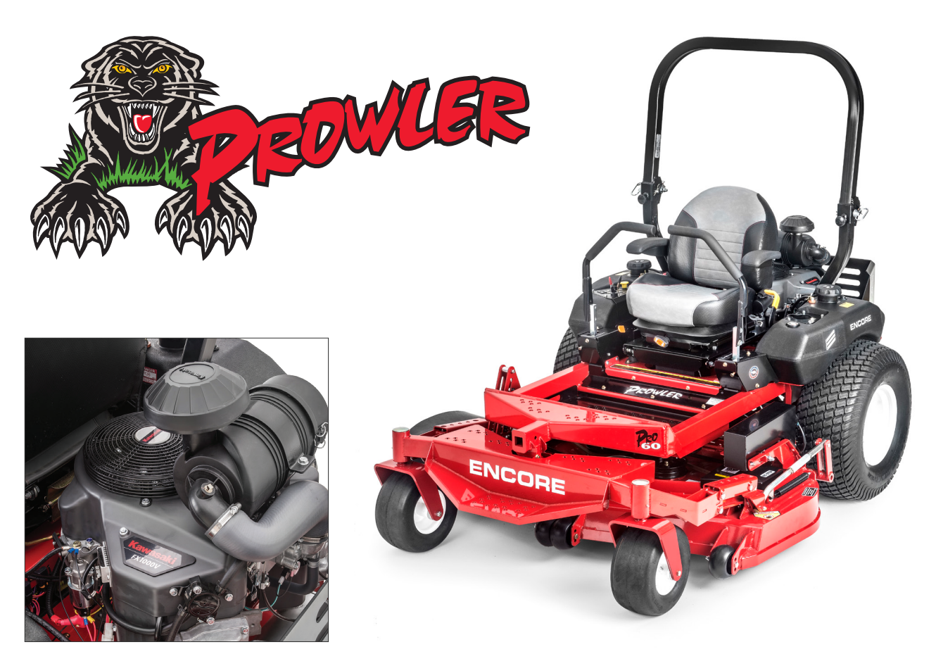
Prowler | Engine View