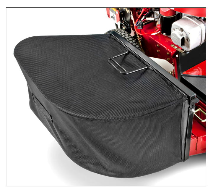
WALK BEHIND | Grass Catcher