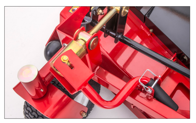
TRACER | Precision Height of Cut Adjustment