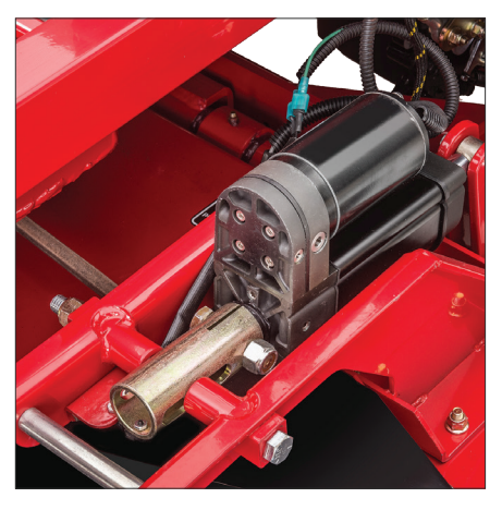
Prowler | Electric Deck Lift

Get power and versatility with the true, floating deck on a mid-mount rider. The Prowler's articulating, floating deck was developed to "keep the cut" on uneven groundminimizing scalping and maximizing stability and comfort.