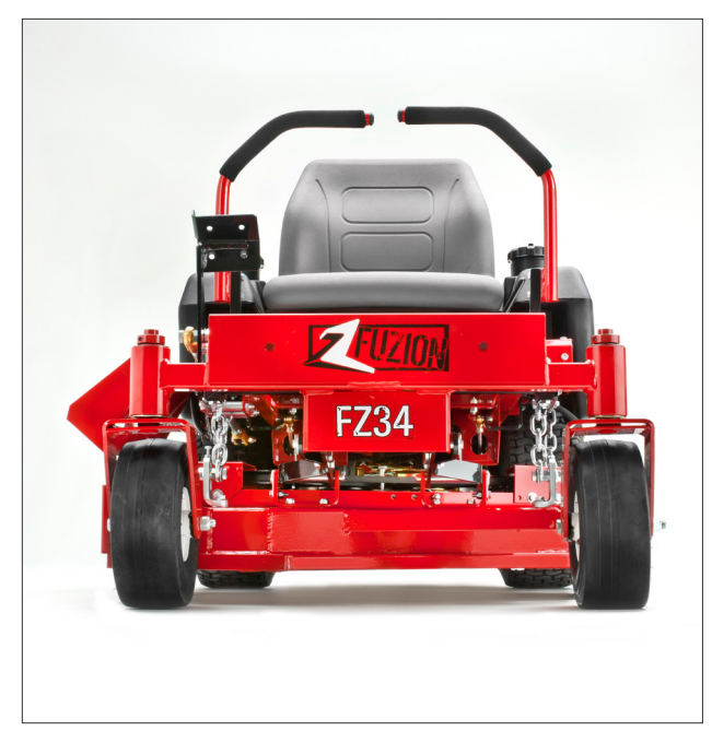
FUZION | Front View