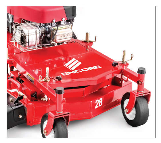
WALK BEHIND | Front View