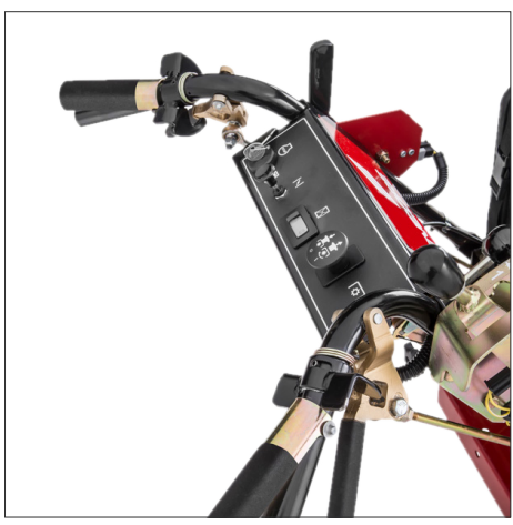
HYDRO SERIES | Easy to Use Controls