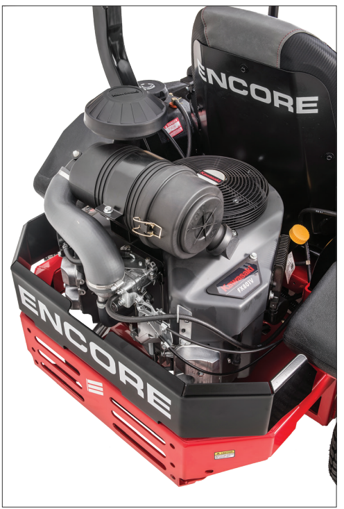
Caliber | Convenience Step