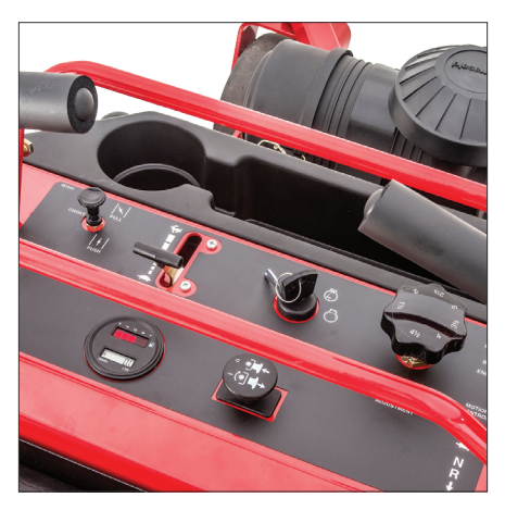
RAGE | Easy Access Height Adjustment Knob

The Rage stand-on machine combines the flexibility and safety of a walk-behind mower with the speed and precision of a sit-down rider. The ergonomically designed, contoured operator pad and easy flip-up, shock absorbing platform are examples of the focus given to operator comfort. The Rage will give you a professional cut without having to pay the professional price.