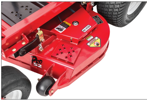
Caliber | Convenience Step